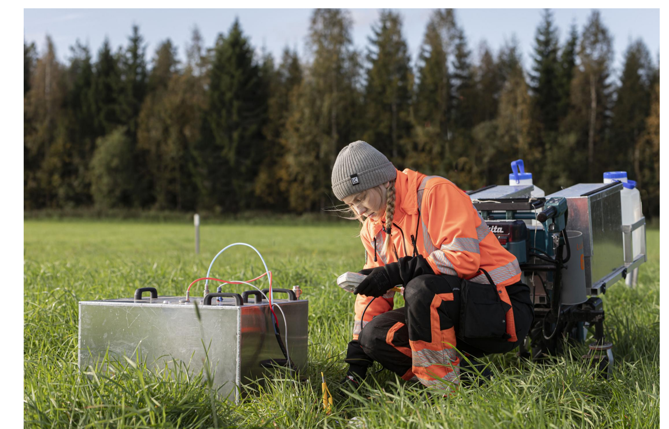
Figure 2. Closed chamber method with a portable analyzer was used for measuring N 2 O emissions during snow-free period.